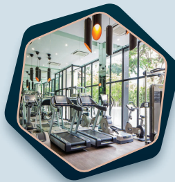
Fully Functional Gym